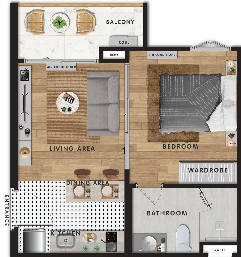
TYPE A : 36 SQ.M.