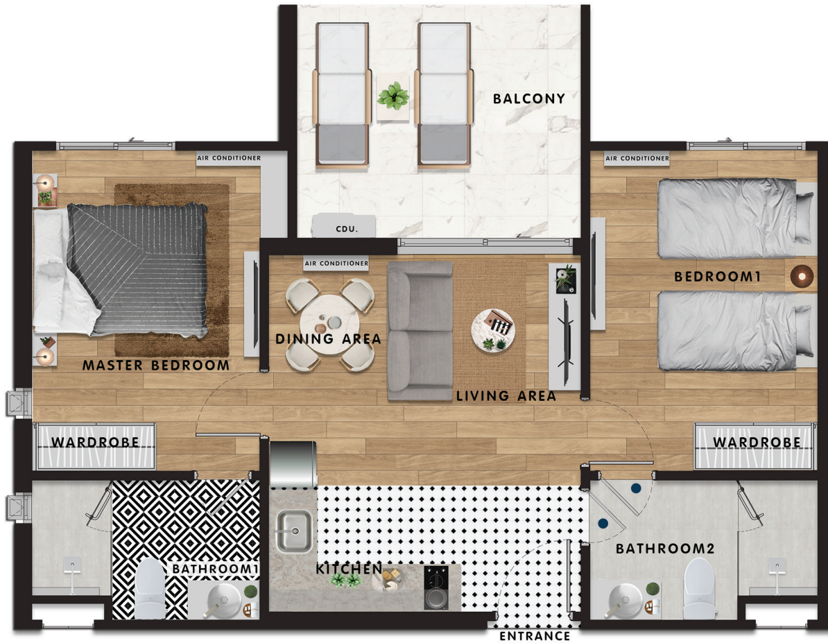
TYPE D1 : 64 SQ.M.