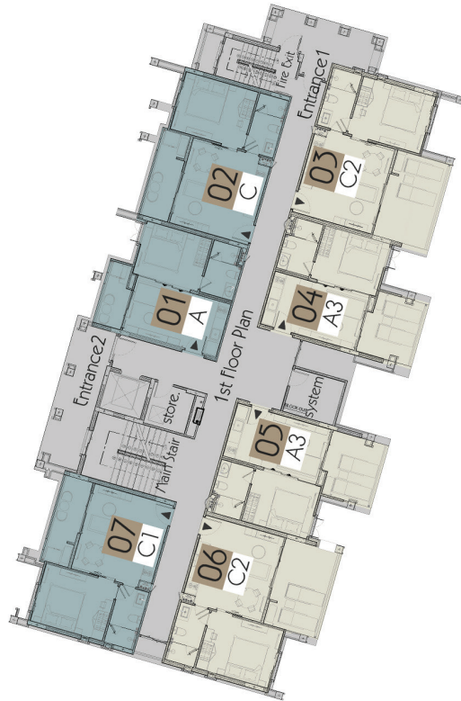
1 st FLOOR PLAN