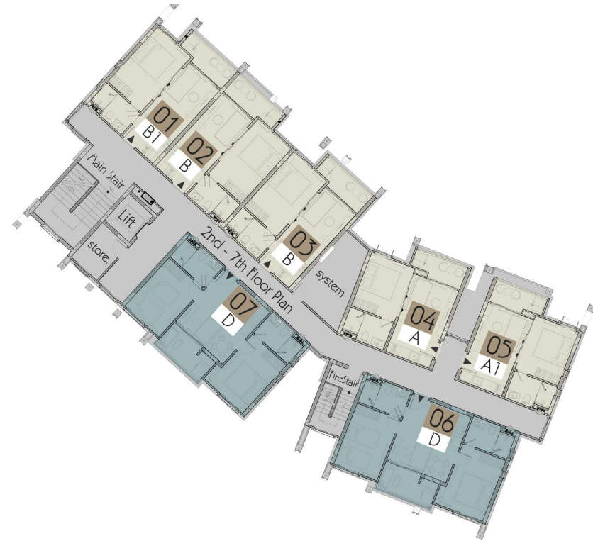
2 nd - 7 th FLOOR PLAN