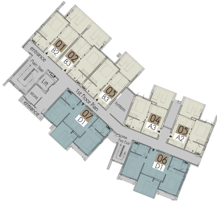
1 st FLOOR PLAN