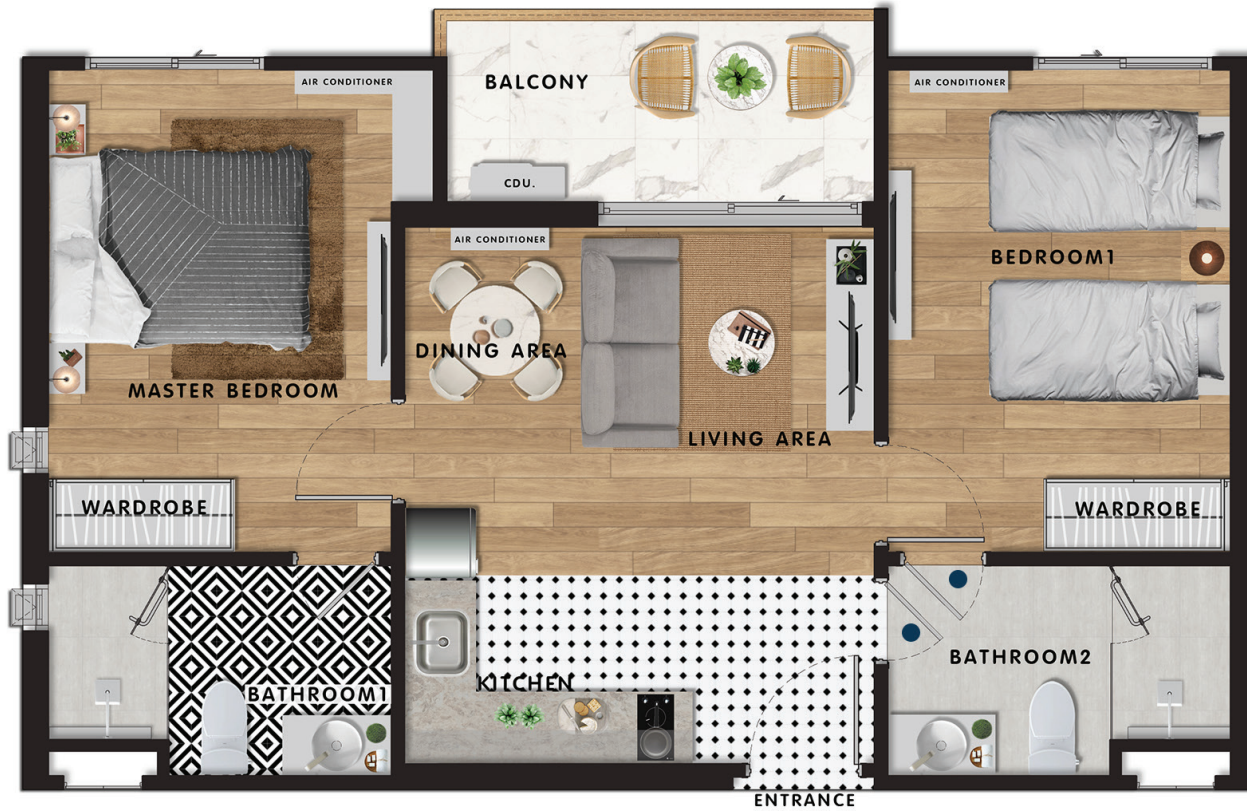
TYPE D : 59 SQ.M.