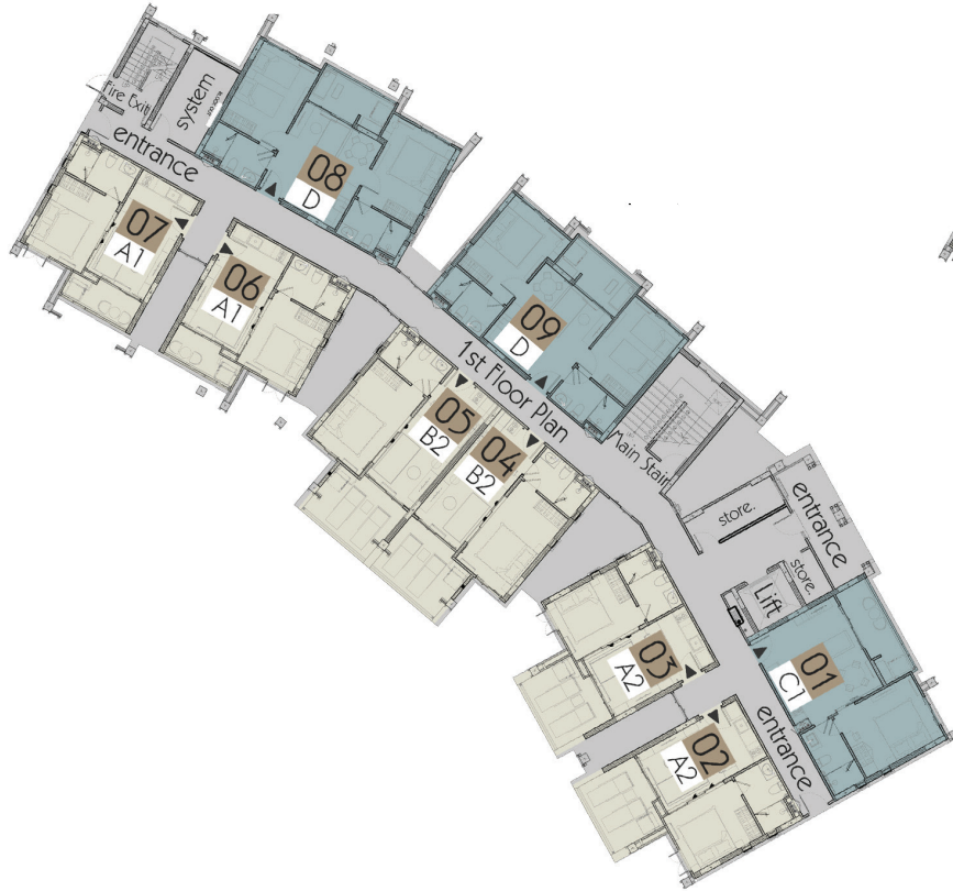
1 st FLOOR PLAN