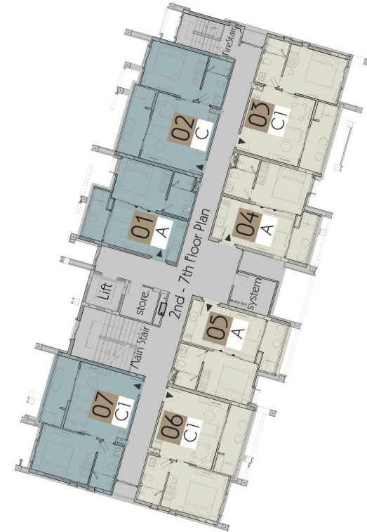
2 nd - 7 th FLOOR PLAN