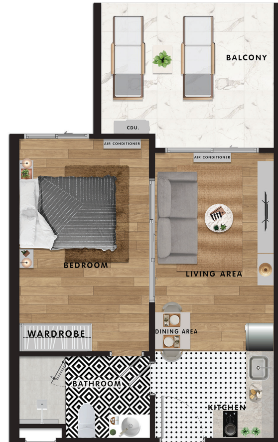
TYPE B2&B3 : 46 SQ.M.