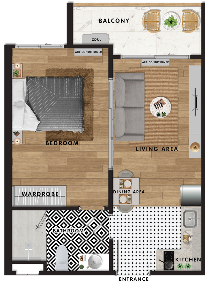
TYPE B : 40 SQ.M.