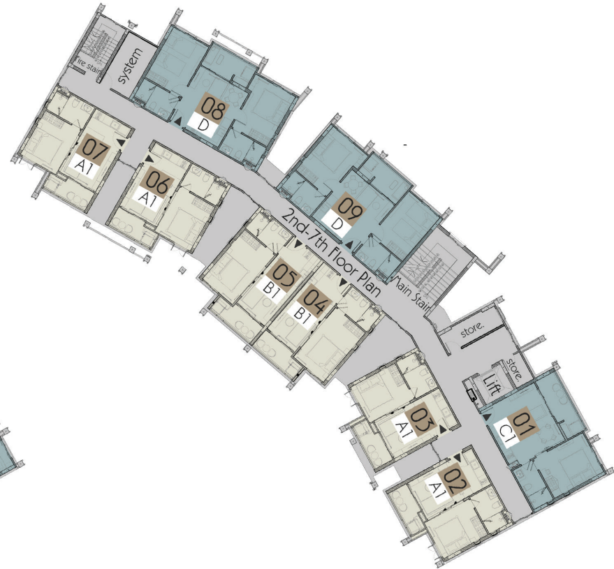
2 nd - 7 th FLOOR PLAN