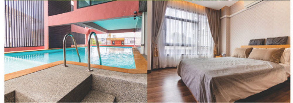
2012 Rungtiva Condominium Co.,Ltd, Condominium for Sale 64 units