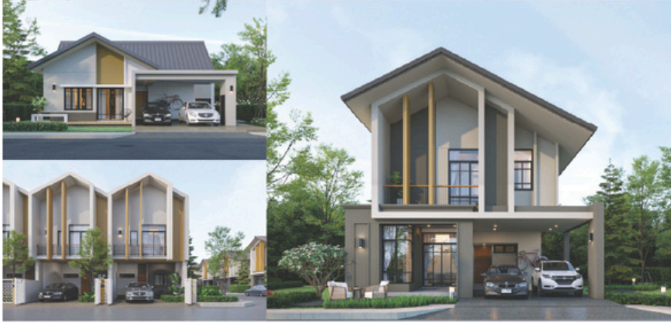
Rungtiva Property Co.,Ltd. Real Estate Developer Songkhla, Thailand