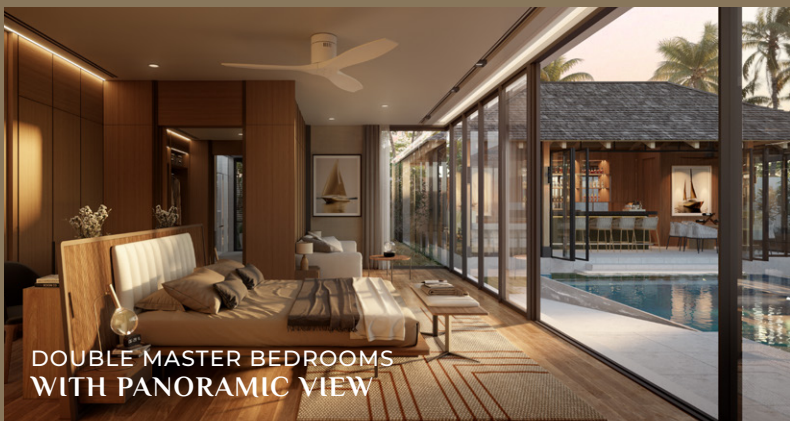
DOUBLE MASTER BEDROOMS WITH PANORAMIC VIEW