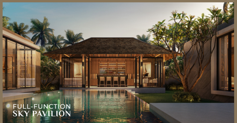
FULL-FUNCTION SKY PAVILION