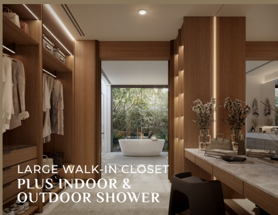
LARGE WALK-IN CLOSET PLUS INDOOR & OUTDOOR SHOWER