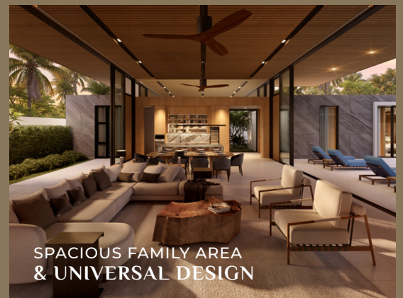
SPACIOUS FAMILY AREA & UNIVERSAL DESIGN